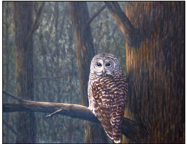
Early Light - Barred Owl, Sherrie Greig 20" (58.4 cm) wide and 16" (40.6 cm) high

She enjoys spending as much time as she can outside, sketching, photographing, painting and gathering ideas for her next Acrylic wildlife painting. Sherrie's artwork donations have helped raise funds to protect and preserve our environment and the animals that depend on it.